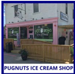
PUGNUTS ICE CREAM SHOP