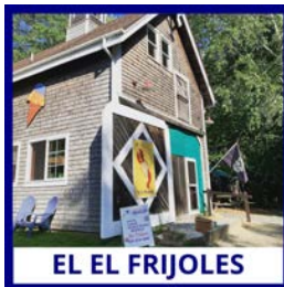
EL EL FRIJOLES