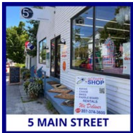
5 MAIN STREET

Microbrewery, on-site tasting and takeaway ales and lagers. Sedgwick · 207-359-8722 · strongbrewing.com