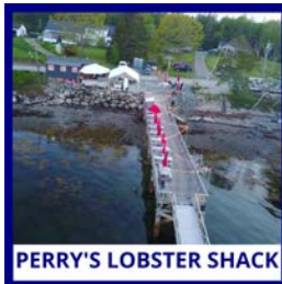
PERRY'S LOBSTER SHACK